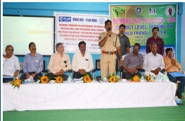
With Government Departments