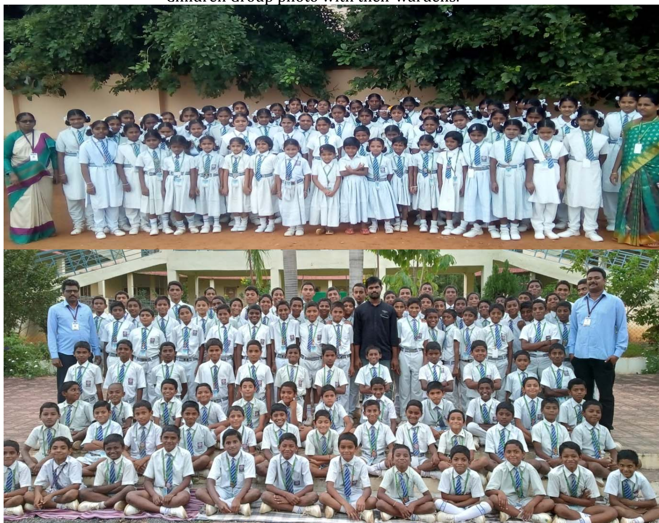
Children Group photo with their wardens.